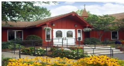
Faith Lutheran Church 6142 State Rt. 31 Cicero, NY 13039

Rejoyce evermore. Pray without ceasing. In everything give thanks: for this is the will of God in Christ Jesus concerning you.